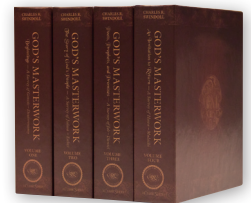
God's Masterwork, Volumes One–Four (A Survey of the Old Testament) by Charles R. Swindoll Classic CD series of 40 CDs