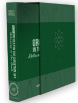
Growing Deep in the Christian Life: Returning to Our Roots by Charles R. Swindoll CD series of 23 CDs