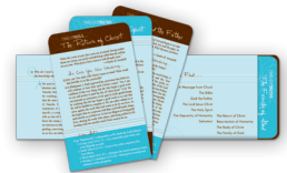
Essential Truths: A Pocket Guide for Growing Deep by Insight for Living card set