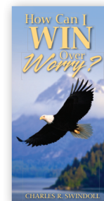
How Can I Win Over Worry? by Insight for Living booklet