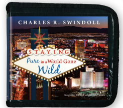
Staying Pure in a World Gone Wild by Charles R. Swindoll CD series