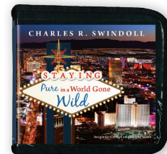
Staying Pure in a World Gone Wild by Charles R. Swindoll CD series