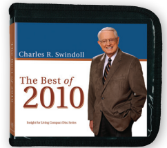
The Best of 2010 by Charles R. Swindoll CD series