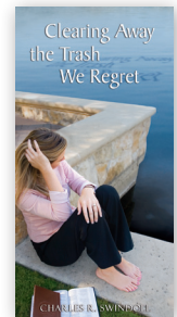
Clearing Away the Trash We Regret by Charles R. Swindoll booklet