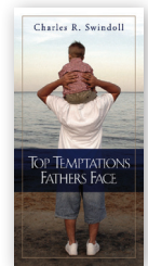
Top Temptations Fathers Face by Charles R. Swindoll softcover booklet