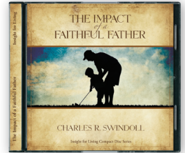
The Impact of a Faithful Father by Charles R. Swindoll CD set