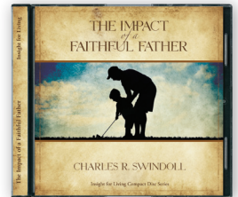
The Impact of a Faithful Father by Charles R. Swindoll CD set