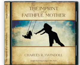
The Imprint of a Faithful Mother by Charles R. Swindoll CD set