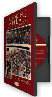
Looking Ahead to Things That Last by Charles R. Swindoll DVD