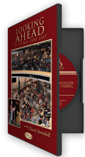
Looking Ahead to Things That Last by Charles R. Swindoll DVD