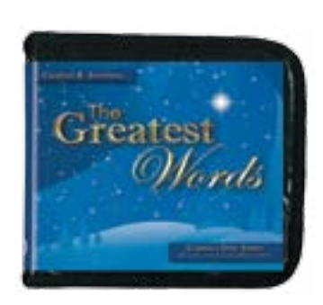
The Greatest Words by Charles R. Swindoll CD series