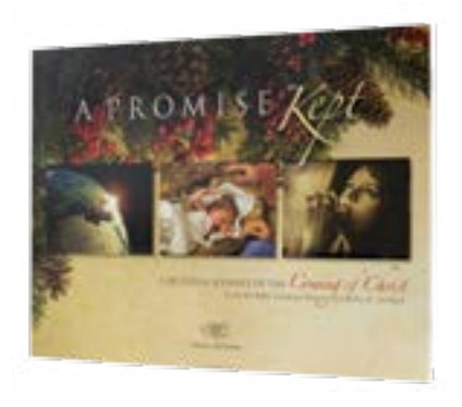
A Promise Kept: A Pictorial Journey of the Coming of Christ by Insight for Living Ministries softcover book