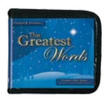
The Greatest Words by Charles R. Swindoll CD series