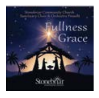
Fullness of Grace by Charles R. Swindoll and Stonebriar Community Church

For these and related resources, visit www.insightworld.org/store or call USA 1-800-772-8888 • AUSTRALIA +61 3 9762 6613 • CANADA 1-800-663-7639 • UK +44 1306 640156