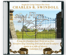
Stand Firm in Your Freedom by Charles R. Swindoll CD