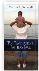
Top Temptations Fathers Face by Charles R. Swindoll softcover booklet