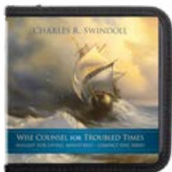
Wise Counsel for Troubled Times by Charles R. Swindoll CD series