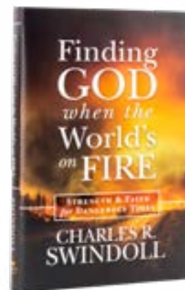
Finding GOD When the World's on FIRE by Charles R. Swindoll hardcover book

For these and related resources, visit www.insightworld.org/store or call USA 1-800-772-8888 • AUSTRALIA +61 3 9762 6613 • CANADA 1-800-663-7639 • UK +44 1306 640156