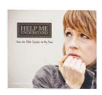
Help Me Understand: How the Bible Speaks to My Pain by Insight for Living Ministries Canada softcover book