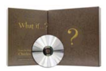
What If . . . ? by Charles R. Swindoll and Insight for Living Ministries Classic CD series