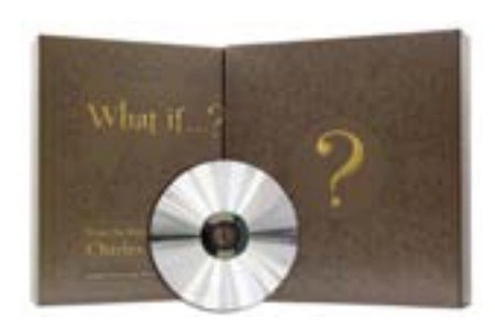
What If . . . ? by Charles R. Swindoll and Insight for Living Ministries Classic CD series