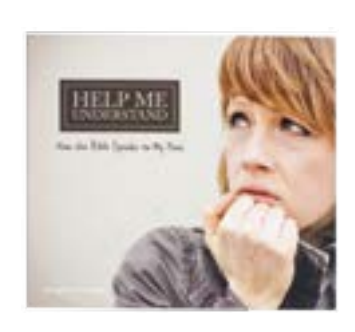
Help Me Understand: How the Bible Speaks to My Pain by Insight for Living Ministries Canada softcover book