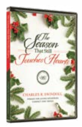
The Season That Still Touches Hearts by Charles R. Swindoll CD series