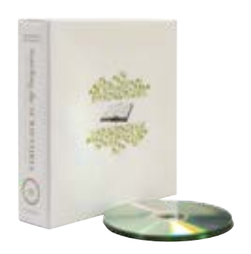
Searching the Scriptures: Find the Nourishment Your Soul Needs— A Classic Series by Charles R. Swindoll CD series