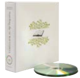
Searching the Scriptures: Find the Nourishment Your Soul Needs— A Classic Series by Charles R. Swindoll CD series