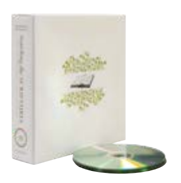
Searching the Scriptures: Find the Nourishment Your Soul Needs— A Classic Series by Charles R. Swindoll CD series