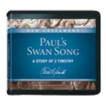
Paul's Swan Song: A Study of 2 Timothy by Charles R. Swindoll and Insight for Living Ministries CD series