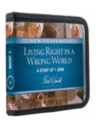
Living Right in a Wrong World by Charles R. Swindoll CD series