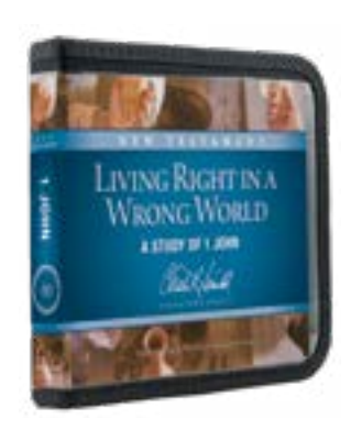
Living Right in a Wrong World by Charles R. Swindoll CD series