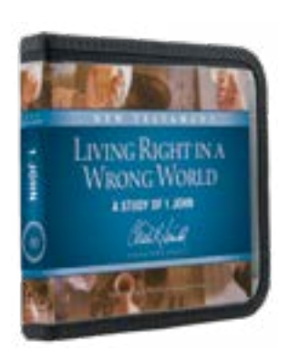
Living Right in a Wrong World by Charles R. Swindoll CD series