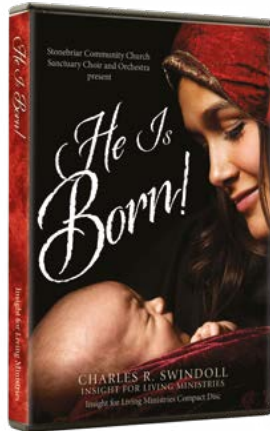
He Is Born by Stonebriar Community Church Choir and Orchestra compact disc