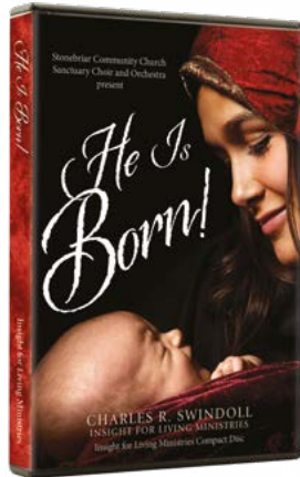
He Is Born by Stonebriar Community Church Choir and Orchestra compact disc