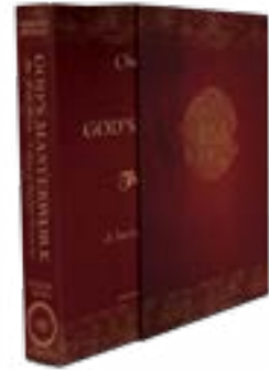
God's Masterwork, Volume Seven: The Final Word—A Survey of Hebrews–Revelation by Charles R. Swindoll CD series

For these and related resources, visit www.insightworld.org/store or call USA 1-800-772-8888 • AUSTRALIA +61 3 9762 6613 • CANADA 1-800-663-7639 • UK +44 1306 640156