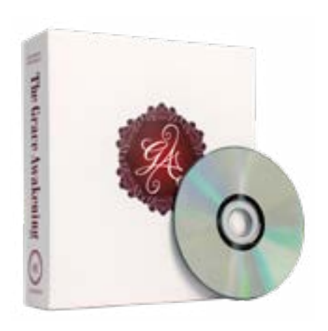
The Grace Awakening by Charles R. Swindoll CD series