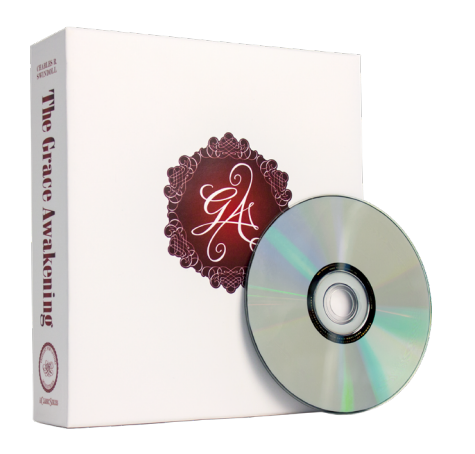
The Grace Awakening by Charles R. Swindoll CD series