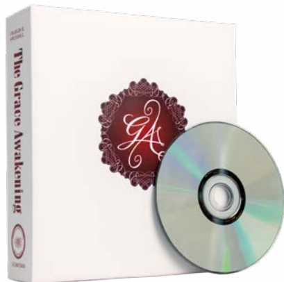
The Grace Awakening by Charles R. Swindoll CD series