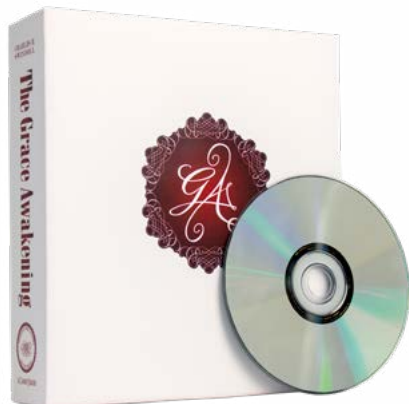
The Grace Awakening by Charles R. Swindoll CD series