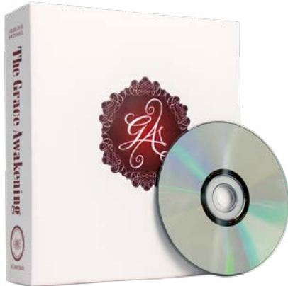
The Grace Awakening by Charles R. Swindoll CD series