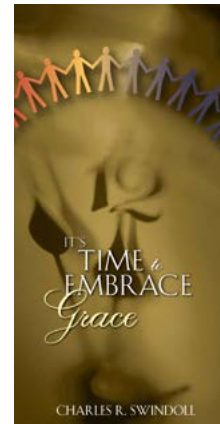
It's Time to Embrace Grace by Charles R. Swindoll booklet

For these and related resources, visit www.insightforliving.org.uk/store or call UK +44 1306 640156 • USA 1-800-772-8888 • AUSTRALIA +61 3 9762 6613 • CANADA 1-800-663-7639