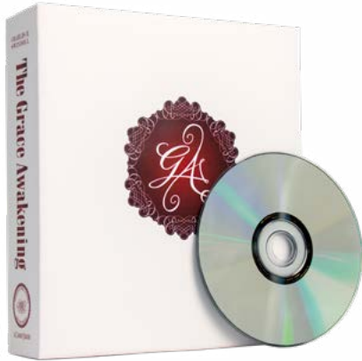
The Grace Awakening by Charles R. Swindoll CD series