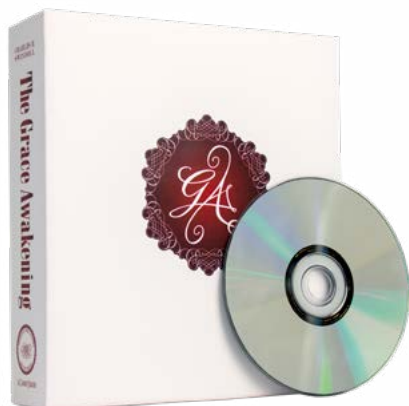
The Grace Awakening by Charles R. Swindoll CD series