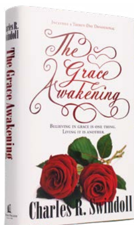
The Grace Awakening by Charles R. Swindoll hardcover book