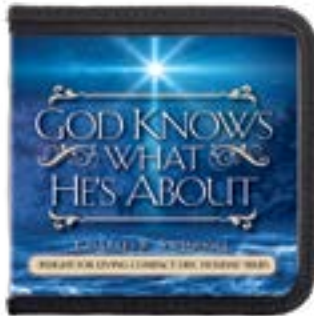
God Knows What He's About by Charles R. Swindoll CD series