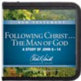
Following Christ . . . The Man of God: A Study of John 6–14 by Charles R. Swindoll CD series