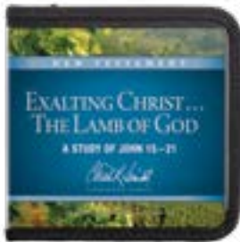
Exalting Christ . . . The Lamb of God: A Study of John 15–21 — A Signature Series by Charles R. Swindoll CD series