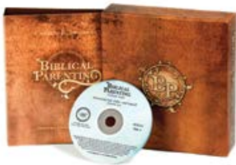
Biblical Parenting by Charles R. Swindoll CD series