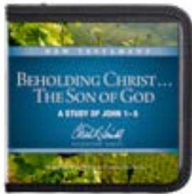
Beholding Christ . . . The Son of God: A Study of John 1–5 by Charles R. Swindoll CD series