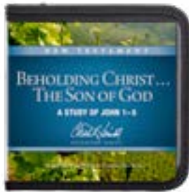
Beholding Christ . . . The Son of God: A Study of John 1–5 by Charles R. Swindoll CD series