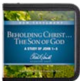
Beholding Christ . . . The Son of God: A Study of John 1–5 by Charles R. Swindoll CD series