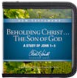
Beholding Christ . . . The Son of God: A Study of John 1–5 by Charles R. Swindoll CD series