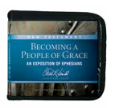
Becoming a People of Grace by Charles R. Swindoll CD series