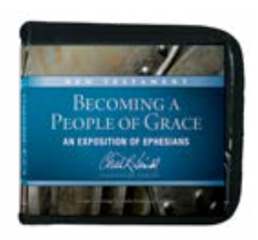
Becoming a People of Grace by Charles R. Swindoll CD series