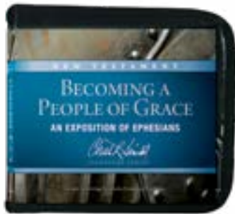
Becoming a People of Grace by Charles R. Swindoll CD series