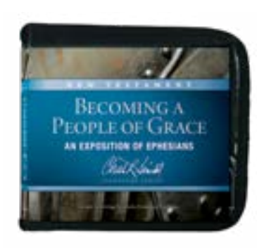
Becoming a People of Grace by Charles R. Swindoll CD series