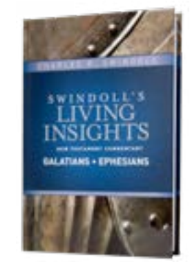
Swindoll's Living Insights New Testament Commentary Insights on Galatians, Ephesians by Charles R. Swindoll hardcover book

Becoming a People of Grace by Charles R. Swindoll CD series